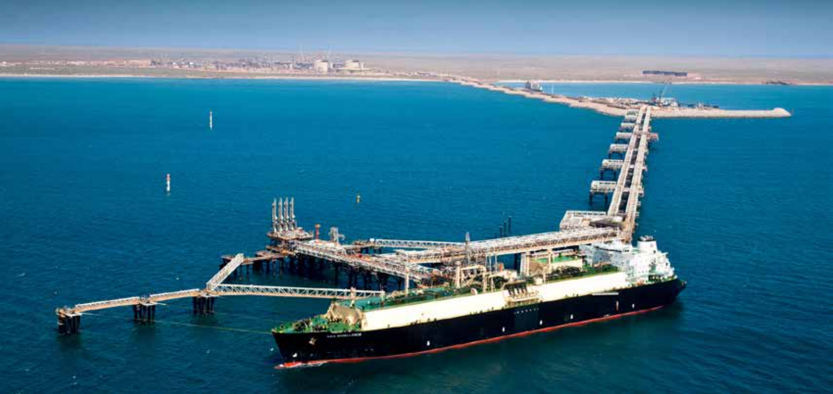
The Asia Excellence loading the first Gorgon liquefied natural gas (LNG) cargo for delivery into Japan