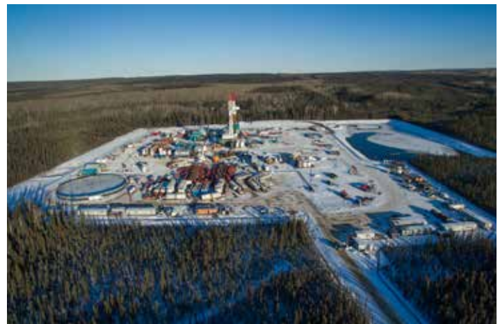
Kitimat LNG, Liard/Horn River Resources North Pad

In continuing a significant capital spending program on Kitimat LNG in 2016, Chevron and Woodside will build on the major milestones that have already been accomplished by the Kitimat LNG project; this includes substantial early site work on the LNG plant at Bish Cove and along the proposed Pacific Trail Pipeline route between Summit Lake and Kitimat. We've received all major environmental and regulatory permits, finalized the First Nations Limited Partnership (FNLP) agreement with all 16 First Nations along the pipeline route, and continue to make excellent progress in the natural gas resource appraisal program in the Liard Basin.