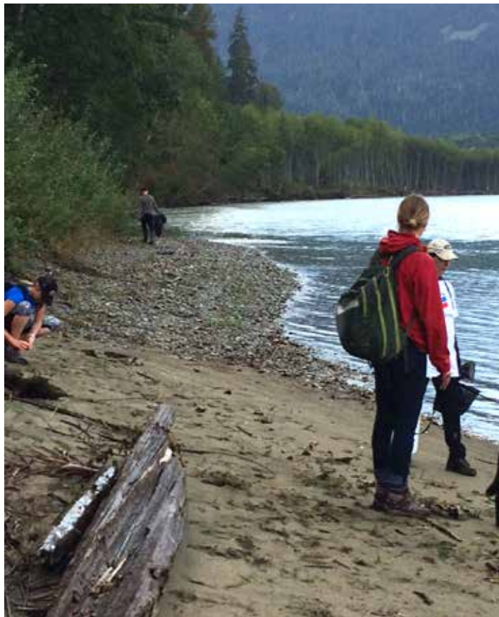
Kitimat River Clean Up crew - September 2015

Chevron focuses its social and community investment in the areas of health, education, economic development and community partnerships that contribute to identified needs while delivering sustainable and measurable outcomes. Wherever we are, Chevron strives to be a good neighbour, sharing the concerns of our communities and working to create a better future.