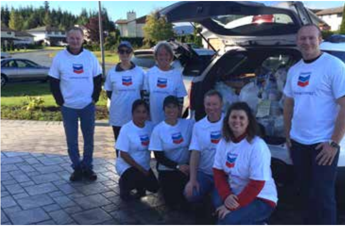
Kitimat LNG volunteers assisted the Kitimat Food bank drive in 2015