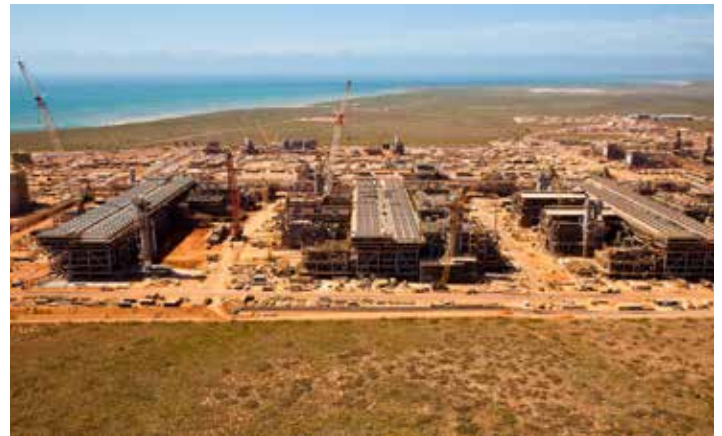
Three LNG production units, known as "trains," at the Gorgon facility

Seven years from FID to the first shipment of LNG may seem like a long time. The Gorgon project shows building LNG facilities is much more of a marathon than a sprint. But with perseverance and commitment to doing a project the right way, a world-class LNG project can become a reality.